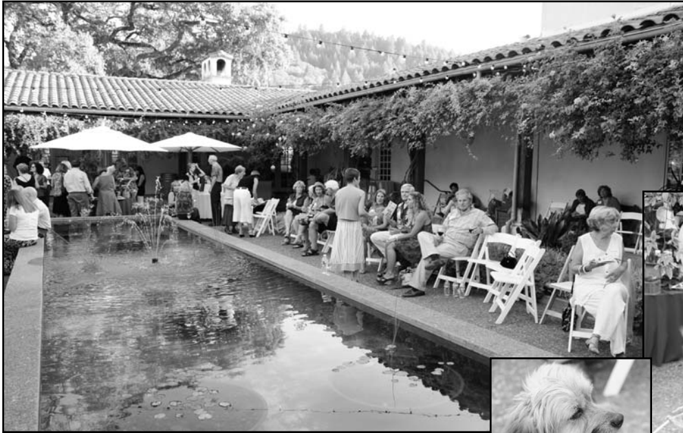
Left: Michel-Schlumberger Winery courtyard