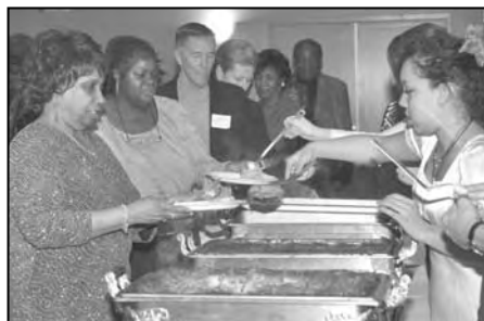
A delicious buffet dinner was served