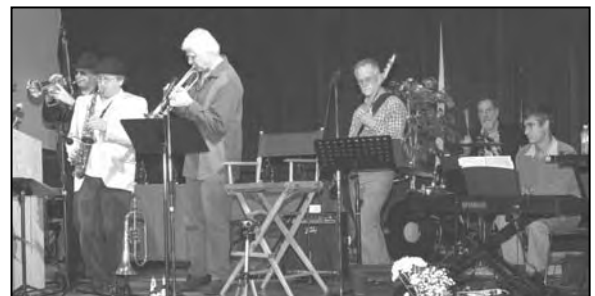
The Wicked Uncles provided jazz accompaniment