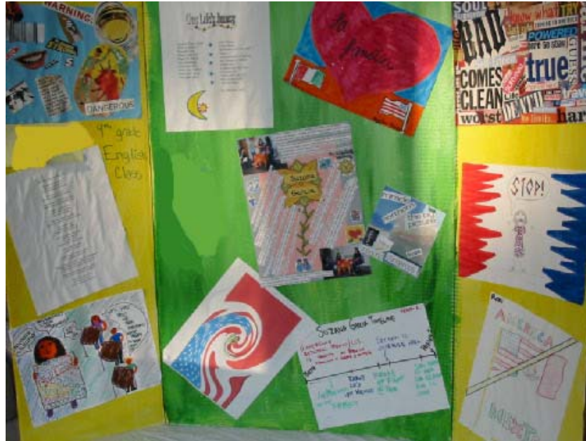
Poster display with poetry and collage/art representing themes from the interview. The poster also included some background on the interviewee's life.