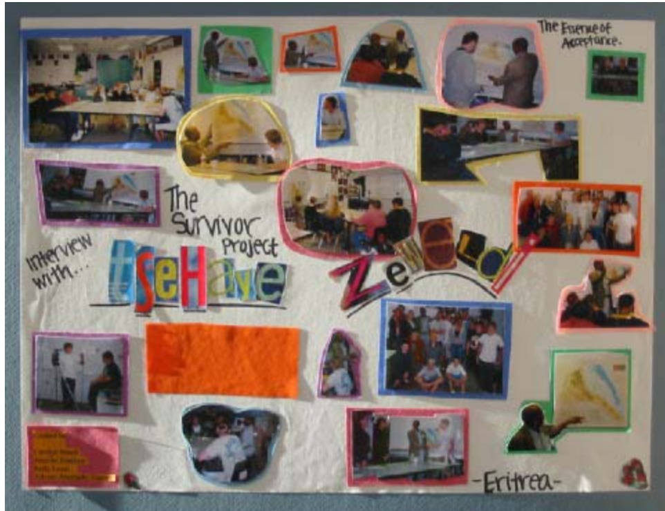
A poster with a photo collage with photos taken during the interview.